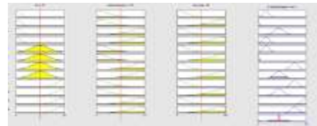
FIGURE 2B. A DIFFERENT COMBINATION OF THE FACTORS CAUSING THE RISK OF “LOSSES OF FORKLIFT MATERIALS”

There are three causing factors for the risk of “Losses of forklift materials” shown in Figure 2a. The first column shows the speed of the forklift. The second and third columns demonstrate the two other factors, respectively. The last column shows how these factors affect the probability of occurrence of the risk for different combinations. The graph shown in Figure 2b contains rules as “for instance, if the speed of the forklift is high, its material weight is high, and the clutching power of the forklift is low, there will be losses of materials so much.”