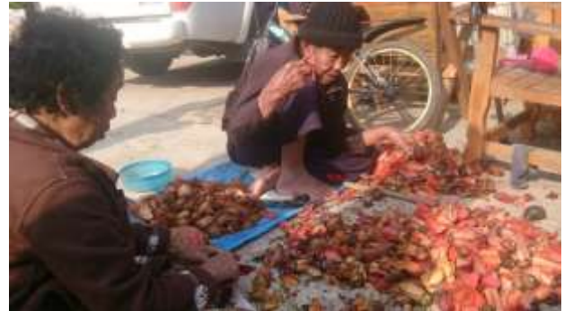
Figure 3. A couple of elderlies do work for their living (Picture was taken by the author as of 8 February 2015)

Poverty is the big problem of the villagers, especially elderlies. From the observations and interviews, it is found that even though the government subsidises the elderlies with Bath 500 ($ 15) per month, many elderlies still have to do work for their livings. For example, a 66-year-old female elderly does needlework with an uncertainty of her income. A couple of elderlies do not have their own accommodation and land. They do a labor work for living wage.