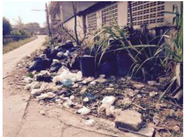
Figure 4. Waste is dumped everywhere (Picture was taken by the author as of 8 February 2015)

have any waste management system. They do not have waste collection vehicle. The villagers therefore do not have the place for disposing of their wastes. She adds that some of them burn the waste which leads to the problem of acrid smoke.