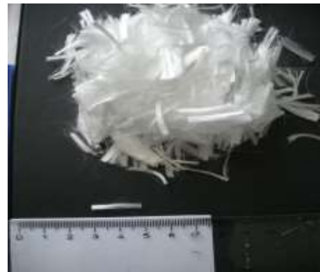
Figure 1. Propylene fibers

In this paper, slabs studied are intended to be flexural load bearing slabs, reinforced with short random fibers with a % 1.5 fiber fraction. Propylene fibers used have 0.91 g/cm 3 of density, 12 mm of length and 3500 MPa of elasticity modulus (Figure 1). Perlite used has 0.08 g/cm 3 of density and 10-120 micron of diameter (Figure 2).