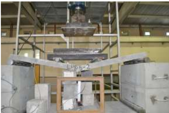
Figure 3. Flexural testing

A total of seven slabs were produced. The slabs were 13cm thick, 50cm wide and 1500cm length. One of the slabs was produced using Control Mix concrete, and it is named Control Slab, three of the slabs were produced using Mix_1 concrete and named Slab_1, three of the slabs were produced using Mix_2 concrete and named Slab_2. The samples were tested by four-point testing to measure flexural strength (Figure 3).