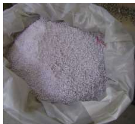
Figure 2. Lightweight aggregate

The samples were produced cement/water/sand/lightweight aggregate/fiber ratio of the concrete produced is 1/0.4/2/0.05/0.015, respectively. The control sample is produced with same cement/water/sand ratio without fibers and lightweight aggregate (perlite). Mix compositions of the samples are given in Table I.