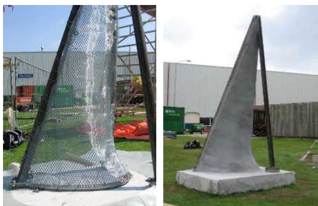
Figure 2. Eindhoven prototype, mesh casted with shotcrete. ( http://www.arnopronk.com/bestanden/PaperArno%20pronk-def%20_3_.pdf )

Waller patented the system Ctesiphon in 1955, in the late 70 system it had been used in over 500 structures throughout the world. One of the examples and the warehouse of the distillery Chivas has a height of about 30m and 150m span, the thickness of the shell is an impressive slenderness with only 6.4 cm, measuring the tissue between the spans 2,54m [1].