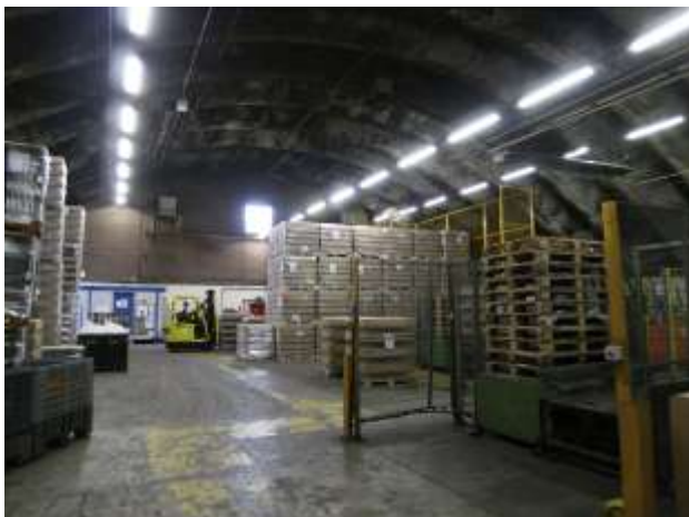
Figure 1. Warehouse of Chivas distillery.