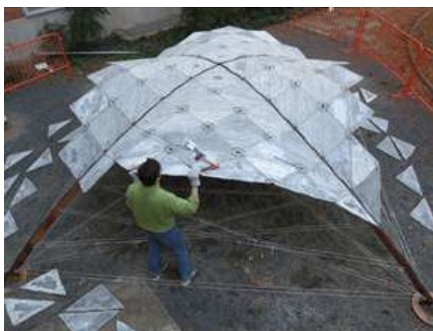
Figure 8. Standart vaults construction.

Serguei Bagrianski Student at Princeton University, developed as part of his master's thesis in 2012 a standard vaults. He believes in the potentiality of the double curvature, for him the answer to build this structural shape is the standardization so he built a prototype in a large scale, made with ultra-high performance fiber reinforced concrete. To produce its modular pieces he divides the vault surface in triangles, using 256 parts. He also created an algorithm that allows to manage vaults divisions. The shape is built only with 16 modules adjustable with 15x15 feet and a thickness of ½ Inch. With this modules he can replicate this shape easily minimize the time of construction and labor cuts.[10].