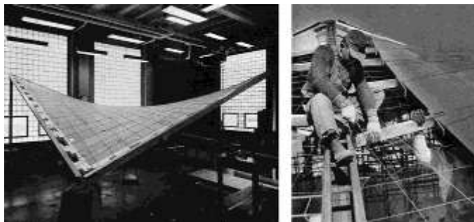
Figure 7. Hibrid structure made by cable net with EPS tiles. ( http://www.design-process-for-prototype-concrete-shells )

This shell had two layers of 3.4 mm wires 1.8 m offset from the straight line generators. The bottom wires were spaced 30 cm apart, the top layer 60 cm apart. The shell used 3 in. thick EPS foam, a 0.5 in. stiffening mortar, a 3 in. concrete cover and traditional rebar, 16.5 cm in total [9].