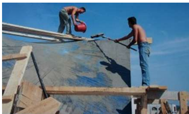
Figure 3. Roof Zed Construction process.

This coverage is characterized by low production costs and a remarkable resistance and waterproofness, is constructed by applying concrete added with latex on a screen support, this process reveals despite its simplicity is highly effective.