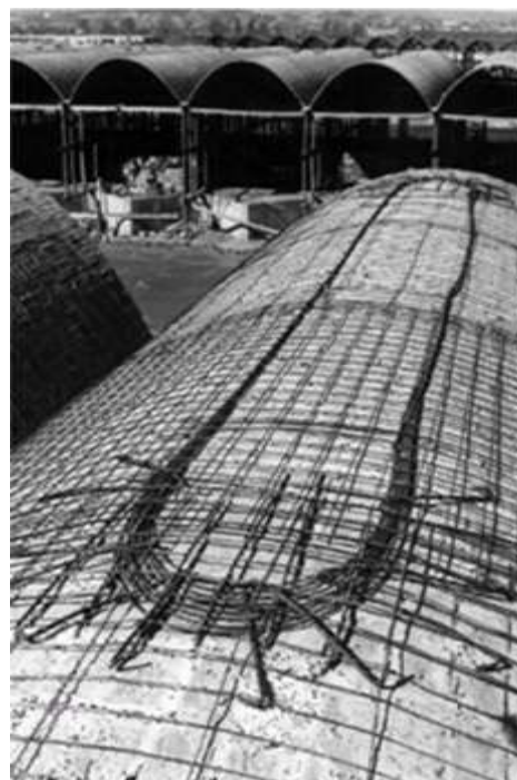
Figure 6. Presstress Stell loops. ( http://communedesign.tumblr.com/post/24644338149/eladio-dieste )

His construction technic was based in low tech solutions, to prestress his structural shapes he overlap steel loops firmly anchored to the vaults, and then with an car jack introduce stress in the surface.