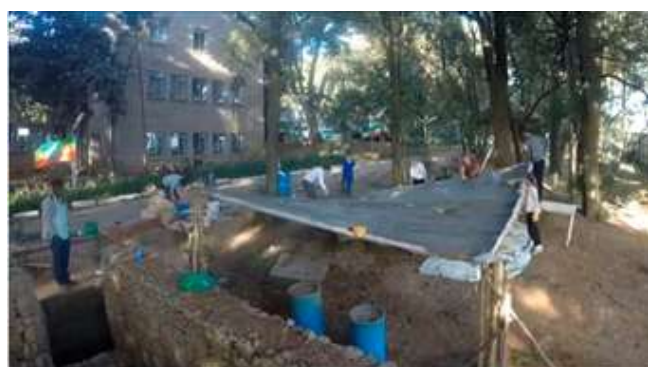
Figure 4. Latex concrete roof made in Ethiopin by the Architecture Institute. ( http://www.hebel.arch.ethz.ch )

The process consists in fixing on the support elements a screen whose core consists in fiber glass then was poured concrete composed by sand, cement, water and latex [4].