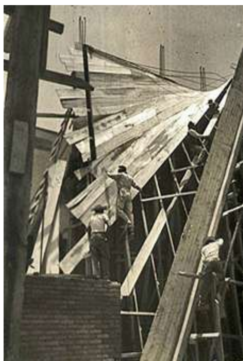
Figure 5. Candela's innovative formwork construction. ( http://www.peri.com/en/projects/cultural-buildings/restaurante-florante-submarino.html )

His vast knowledge of the hyperbolic paraboloid geometry allowed him to design a formwork system based on conjugated linear elements with parts wedge.