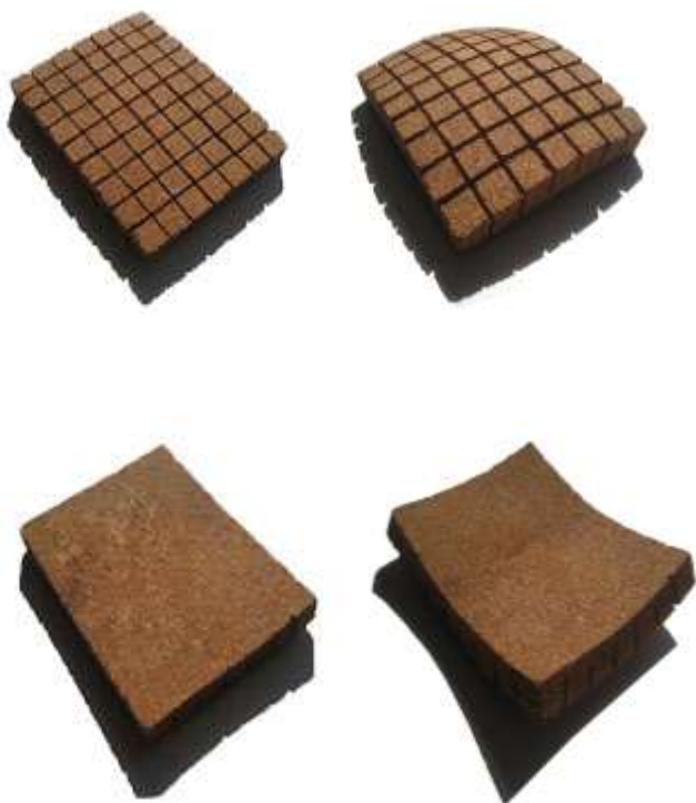
Figure 10. Cutting pattern results , transforming a linear board in to curved surfaces.