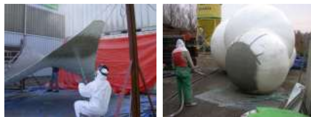
Figure 11. Shotcrete casting process.

Bar chip shows us an excellent structural behavior for the reinforcement of shotcrete for the use on the freeform.