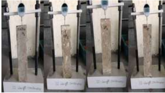
Figure 1 Drying shrinkage evaluation of different specimens

and hybrid mixes were casted and measure of micro-strain with respect to number of days is observed and tabulated. Figure 1 shows the experimental set up to evaluate dry shrinkage of all the concrete mixes.