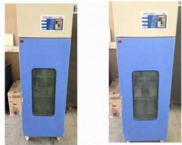
Figure 3. Specimens placed in humidity chamber to freeze and thaw cycle.

Cube specimens of 150mm were casted, placed 2 hours in humidity chamber at 8°C and immersed in water for 2 hours. This cycle is repeated again and then after the specimen is placed under normal water for 16 hours. The water accumulated in the pores is subjected to cyclic freezing and de-freezing which caused wear in the concrete. Figure 3 shows the humidity chamber with test specimens.