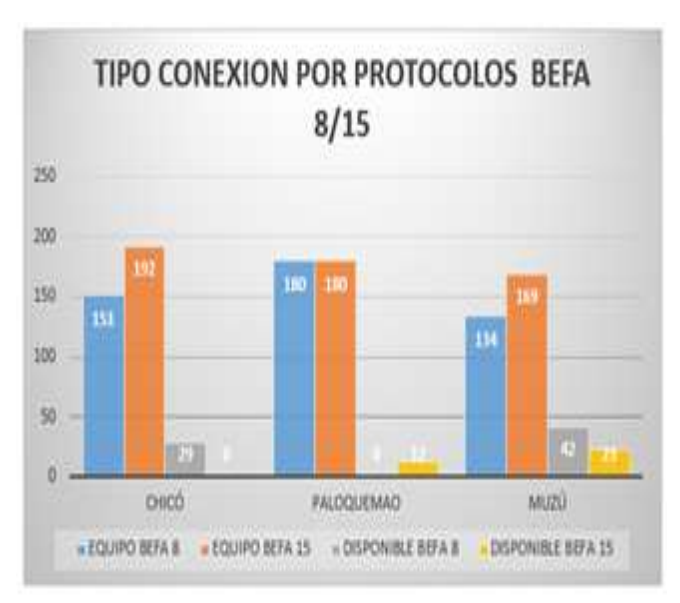
Figure 2. Distribution and control equipment connection for communication protocol type in each of the management traffic lights centers in the city of Bogota on December of 2014 [5]

In the city of Bogotá D.C. currently are installed equipment for 5 different generations and technologies according to his manufacturing date and design, this kind count with a common characteristic, they are capable of interconnecting with different traffic computers in the city [7], the equipment with the system counts in the ground are Siemens GE [8], Siemens MP [9], Siemens MR [10], Siemens Sitraffic C800V/C800Vk [11] y Siemens Sitraffic C900V [12], which technical characteristics more relevant are showing in the following table [5]: