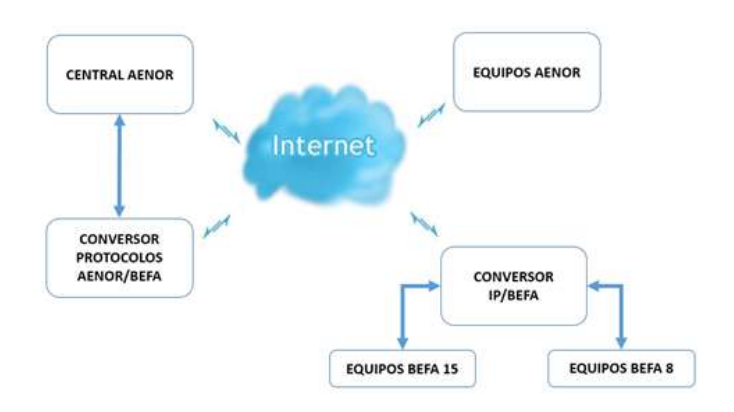
Figure 4.Propose model for system integration

Equally based in the study of both protocols (BEFA and AENOR) its performed a similarities and correlations parallel between the functions designed to software and hardware systems level of translation with the goal of minimize the differences between the technologies