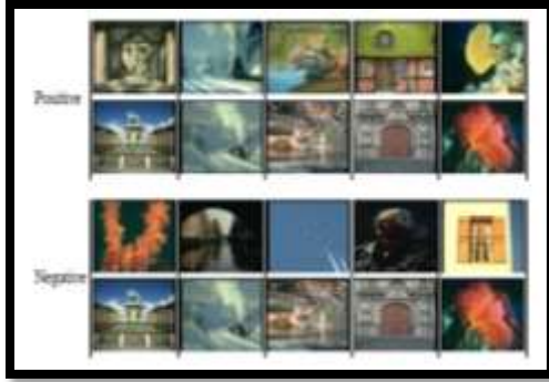
Figure 3 Positive & Negative Image Pairs [Makadia, Pavlovic and Kumar[7]]