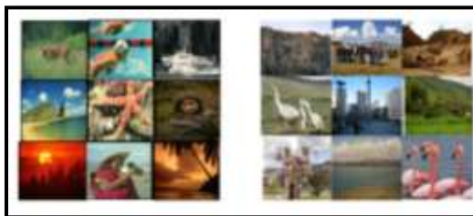
Figure 4 Image Samples of Corel 5k in the left, IAPR TC12 in the Right

In Figure 4, there is some samples from Corel5K and IAPR datasets.