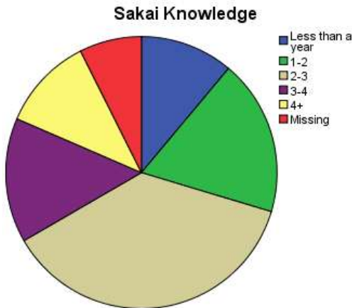
Figure 1 Awareness of the institutional e-learning system

educators frequently integrate the e-learning system tools into education despite their awareness of the system's benefits on education [23]