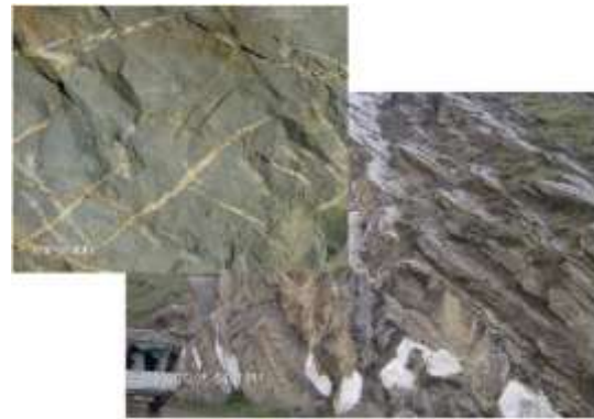
Figure 4. The hard gray veined limestone with calcite extracted locally

The most material used in the construction of the Septimius Severus family Temple is a hard gray veined limestone with calcite. This stone is characterized by a large vein (streak) of calcite, extracted locally, and commonly called micritic limestone, Figure 4.