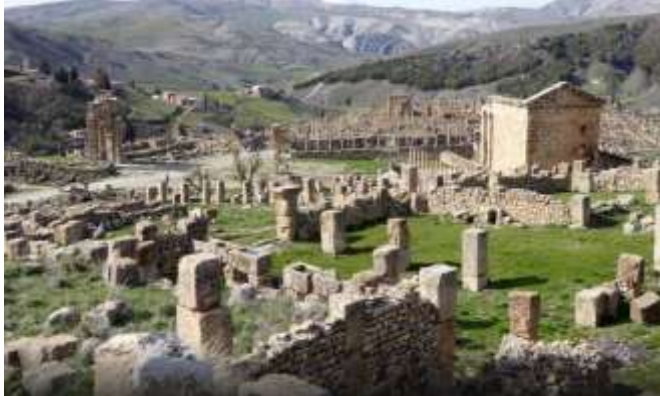
Figure 2. Part of Roman ruins of Djemila

several cult buildings has also marked the site: a cathedral, a church and its baptistry are considered among the biggest of the Paleochristian period. The site of Djemila comprises an impressive collection of mosaic pavings, illustrating mythological tales and scenes of daily life.