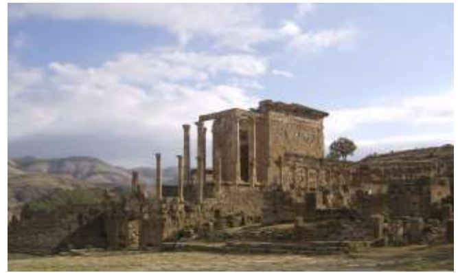
Figure 3. Septimius Severus family Temple

Around the beginning of the 3 rd century, the city of Cuicul expanded beyond its ramparts with the creation of the Septimius Severus Temple, Figure 3.