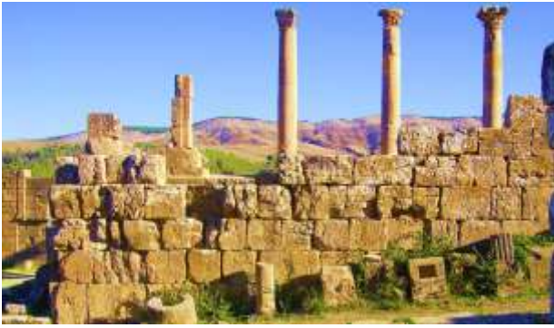
Figure 9. Orange patina

origin of their apparition, namely the biological activity, in this case may probably be the major source of oxalate crusts.