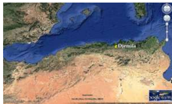
Figure 1. Localization of Djemila in Algeria

The site of Djemila is located in the High Plateaus (1080 m height above sea level) in north-eastern part of Algeria, Figure 1.