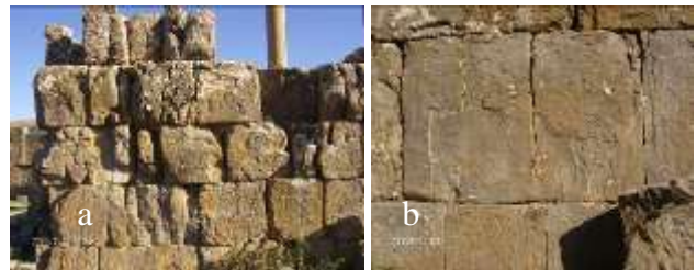
Figure 7. Material loss and cracks

In some part of the temple, masonry element were placed parallel to bedding planes of the rock (Figure 7 (a) and (b)) which causes cracks resulting from anisotropic behavior. It is evident that tensile load is higher perpendicularly to bedding planes whereas the strength of the material in the same direction is lower in tension.