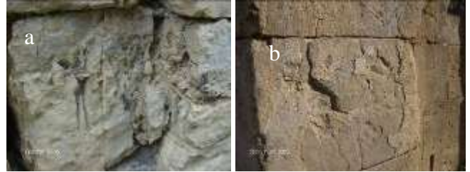
Figure 6. Erosion and contour scaling

dilatation. This will cause shearing stresses in the transition zone from the surface and the deeper parts of the limestone. The absorption of radiant energy rises surface/subsurface temperature gradients and accentuates rates of surface temperature change ultimately contribute to stone breakdown through 'fatigue' effects. This absorption of energy reduces cohesive strength of intergranular bonds and initiates micro-fracture development, Figure 6 (b).