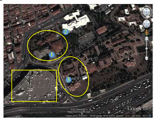
Figure 9. The locations of inclinometer well

In selected three inclinometer wells around the examined area, measurements are performed on twelve different dates different dates. Thus, it is determined that lateral movements, deformations in different depths of the ground. The selected well locations for inclinometer measurements are shown in Fig. 9.