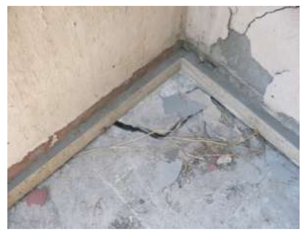
Figure 5. The damages in slab and walls

it is observed that deformations similar to the structure, group I. Hereby, it is reached the conclusion that destroye and rebuild of the building.