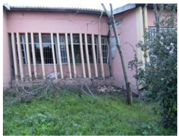
Figure 4. The damages in structural members of Building-1