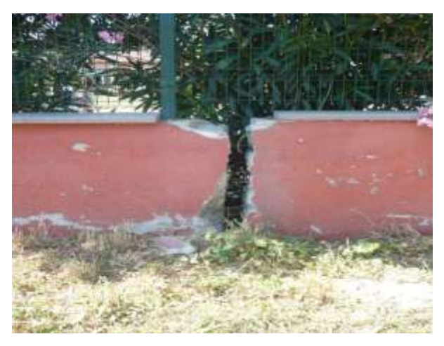
Figure 6. Seperations in walls due to soil movements