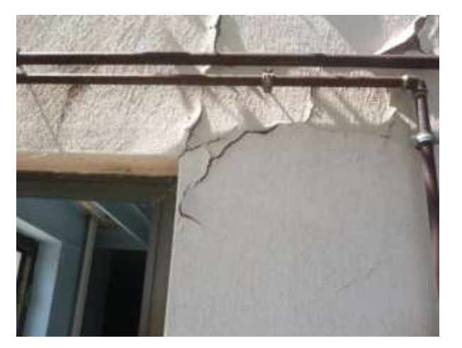
Figure 8. The cracks in column-beam connections

In selected three inclinometer wells around the examined area, measurements are performed on twelve different dates different dates. Thus, it is determined that lateral movements, deformations in different depths of the ground. The selected well locations for inclinometer measurements are shown in Fig. 9.