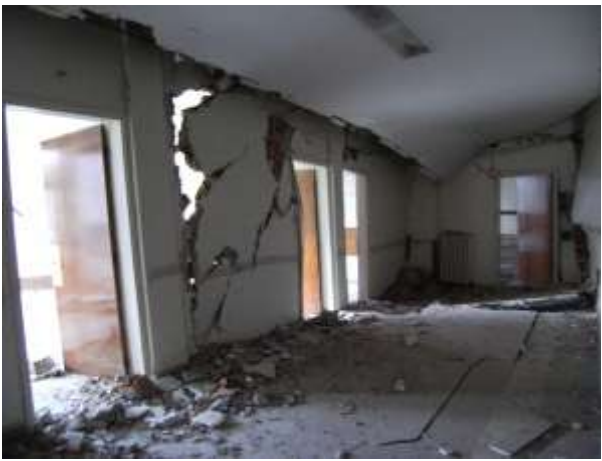
Figure 3. Damages in Building-1