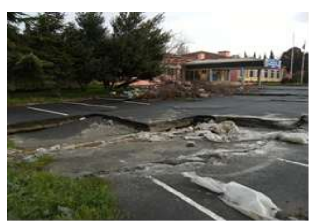
Figure 2. The failures around Building-1

Technical examinations are carried out in the common areas and blocks A/B of Hospital structure (Building-1), one of the damaged structures. In the observations and investigations in Block A, (i) Soil movements and collapses are occurred in garden area, and the roads around the structure (Fig. 2), (ii) Tension cracks and separations are occurred in boundary walls in the direction of foundation excavation direction (Fig. 3), (iii) Especially in the south facade overlooking the deep excavation, it is observed that separations in RC members and connections including rotations as a result of torsional effects due to sliding and subsidence of the ground (Fig. 4). The left part of the building block A is heavily subjected to, damaged deviating from the plumb line, so its stability and carrying capacity. have completely run out. Structural damage is not determined in the basement floor on the right side of the main entrance. The members subjected to damage is not observed in pool area of the third unit which has partially basement floor. In the observational examination of building block B is 220 m of the distance from the excavation site, especially in the wet areas of without basement unit on the left side of the main entrance. 45 degree angled tension cracks are appeared on walls depending on ground subsidence. Accordingly, micro cracks are occurred in wall-beam connections [22].