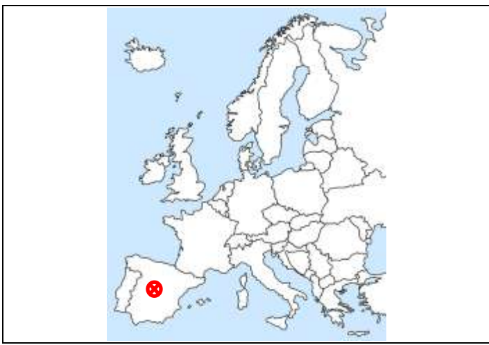
Figure 1. Location map

of the most sparsely populated areas of the Spanish territory, with 1,632 inhabitants in 379 km2, representing a population density of 4.77 inhabitants per km2. The low population density stands out, compared to rural Spain which has an average of 93.43 inhabitants / km2 (14) at a national level 19.79 inhabitants / km2 (15), and at European level 118.67 inhabitants / km2 (16). Despite the small population and an aging population pyramid, the area has a cohesive geographic unit with numerous natural, cultural and environmental resources. The predominant productive activity is dry farming, with 40.5% of the area occupied by meadows and pastures (mainly barley and wheat) and livestock production is focused on bovine meat and milk (17).