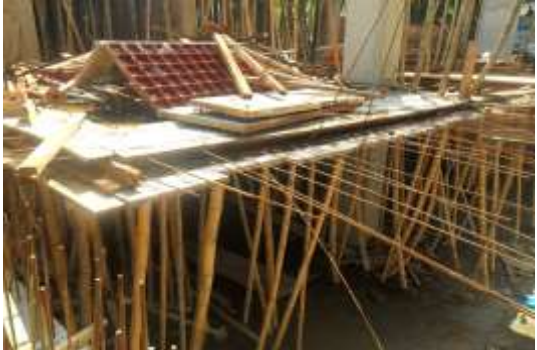
Figure 2. Bamboo props used as scaffolding and no safety net is present (may cause accidents to the pedestrians)