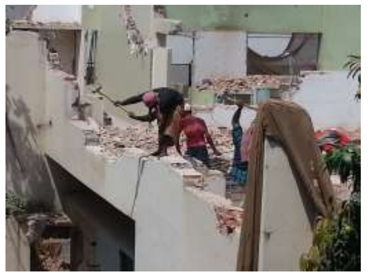
Figure 4. Unsafe condition during demolition work

Building collapse can be caused by bad design, faulty construction, foundation failure, extraordinary loads, unexpected failure, or any combination of these causes. A construction worker's worst nightmares are realized if he or she is in a building during its collapse. Victims may be injured, crushed or killed as debris and materials fall down around and over them. However, when a collapse takes place it is a failure of many and a manifestation of irresponsibility and expertise. Lot of accidents also takes place during the demolition works of old buildings. Figure 4 shows an unsafe condition during demolition work.