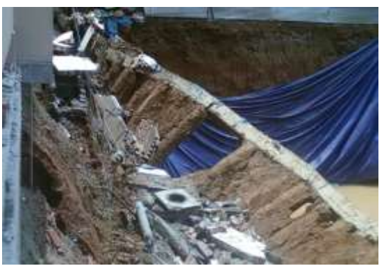
Figure 3. Trench collapse on a construction site

The construction of trenches is needed for many construction tasks. It is absolutely essential that appropriate safety measures are taken during the building process to ensure the safety of all workers involved. When trenches are constructed they must have safeguards in place to protect workers inside the trench from a collapse. When a trench collapses workers may easily become buried under the weight of heavy soil from above. Figure 3 shows trench collapse on a construction site in Bangladesh.