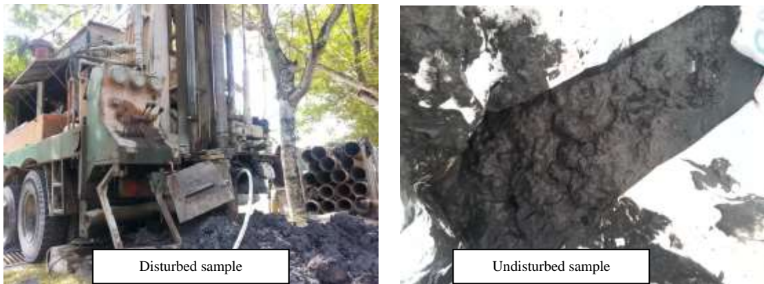
Figure 3: Disturbed sample from drilling works and undisturbed sample from required depths.