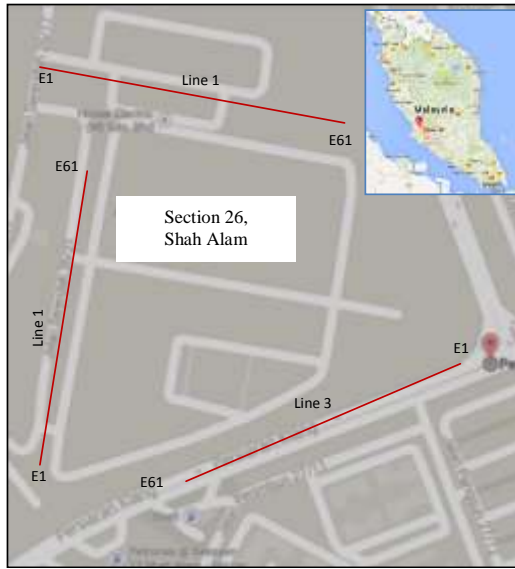
Figure 1: Location map of study area and alignment of resistivity survey lines

were laid. Alignment of resistivity lines at the study area as illustrated in Figure 1.