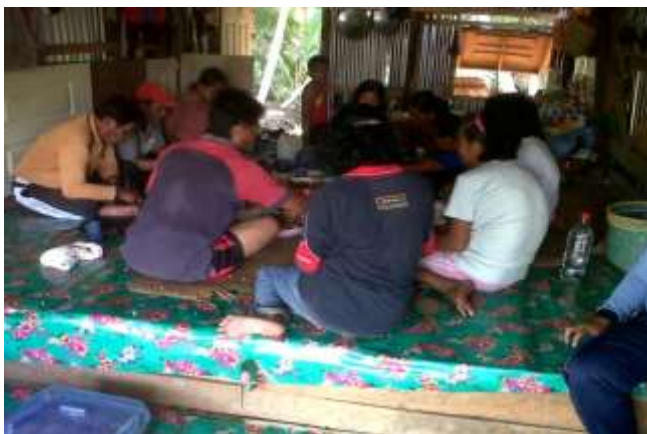
Figure 5: The Farmers Attending The Ritual Ceremony at Sungai Semanok, Sarawak

Refer to Figure 3 and 4, the berdandang system cannot be practiced by only one farmer. The system needs a strong community, good relationship and unity spirit among the farmers to make sure this system can be applied. This system also requires the cooperation between farmers because in any process or stages of paddy planting, the farmers must work simultaneously. The rational of this concept is to make sure that paddy can grow and harvest at the same period and maintenance task can be done simultaneously. The task distribution among gender also exist in this case (Refer to Figure 5).