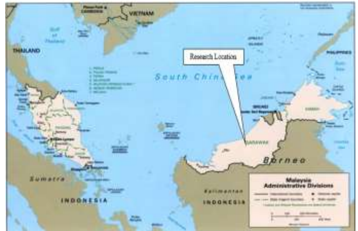
Figure 1: Map of Kuala Tatau in the State of Sarawak

Iban farmers also practiced berduruk system whereby all or some of the farmers at the village help each other's at every stage of the paddy cultivation, which are conducted based on rotating shifts [2][5] and practiced their belief system and traditional culture in paddy cultivation [6][7]. Both of this belief systems have relationships with their surroundings environment such as with trees, birds, insects and the experiences that they were faced from this system finally contribute to the existence of LK [2]. Figure 1 shows the map of Kuala Tatau in Sarawak [8].