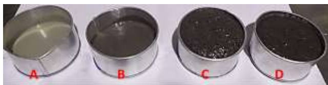
Figure 4. Slurries with KOH after 5:10 min.