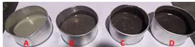
Figure 1. Slurries with KOH after 2:53 min.

The following figures will show the effect of adding the KOH solution to the slurry samples monitored over several time periods.