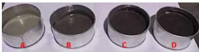
Figure 3. Slurries with KOH after 4:39 min.