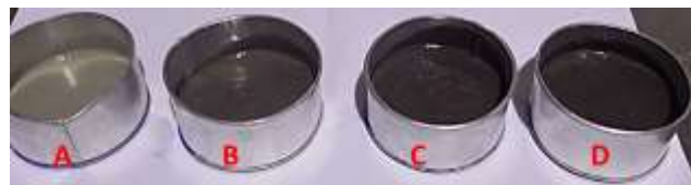
Figure 2. Slurries with KOH after 3:40 min