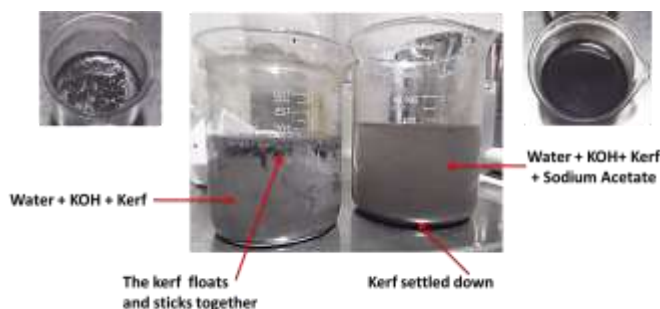
Figure 11. Kerf behavior in KOH solution and in KOH + Sodium Acetate solution.

Figure 11 shows a comparison of the behavior of silicon particles in KOH solution and in KOH+Sodium Acetate solution.