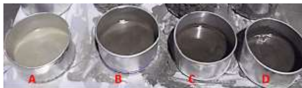
Figure 10. Slurries with Sodium Acetate.

To confirm this result, a solution of sodium acetate only was added to the slurries shown below in Figure 10.