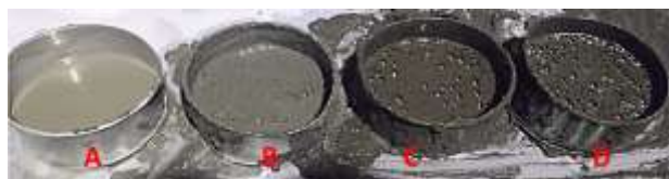
Figure 9. Slurries with KOH + Sodium Acetate.

Figure 9 shows the behavior of the slurries with the addition of KOH and sodium acetate. It is clearly seen that with the addition of the sodium acetate the development of the thick slurry was arrested as compared to the reactions as shown above.