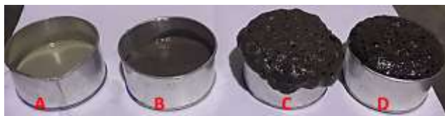
Figure 6. Slurries with KOH after 6:17 min.