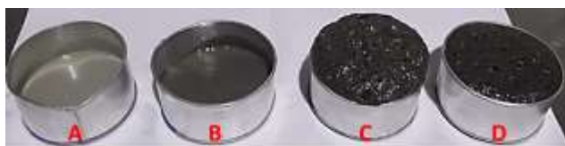
Figure 5. Slurries with KOH after 5:55 min.