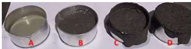
Figure 7. Slurries with KOH after 13:25 min.