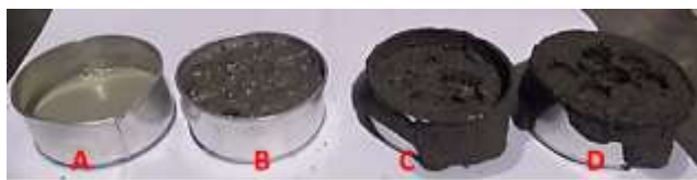
Figure 8. Slurries with KOH after 14:40 min.

From the above Figures 1 to 8 it is readily observed that there is a marked difference in the reaction of the slurries with KOH from each other. The slurry with the highest kerf loading, D , reacted immediately and transformed into thick slurry. On the other hand, the slurry with no kerf loading, A , did not exhibit any change in its consistency. The degree of reaction follows the order of the slurries in terms of their kerf loading, that is D > C > B > A .