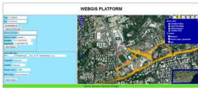
Figure 6. Interface of the Web GIS platform