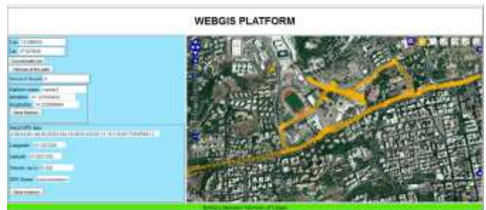
Figure 7. Toolbar for digitizing possible obstacles identified on the cartography support

Moreover two bars have been inserted on the left and right bottom corners for scaling and for dynamically representing the coordinates when the mouse moves on the map.