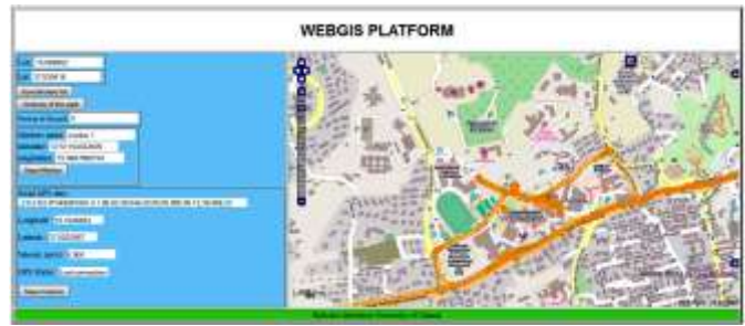
Figure 3. Robot track on the OpenStreetMap cartographic support with a WGS84 datum

Finally, the latitude and longitude of the selected NMEA string are automatically converted within the source code of the Web GIS platform from degrees, minutes and seconds to sexagesimal units for a correct georeferencing on the raster cartography map with a WGS84 datum (Figure 3).