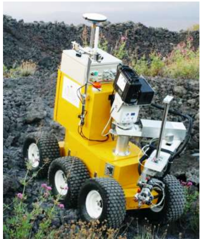
Figure 1. ROBOVOLC, a mobile robot for volcano exploration ( http://www.robovolc.dieses.unict.it/ )

This architecture has been enriched using a direct link with a spatial database to guarantee a unique software tool for the management of the spatial data, allowing the exploitation of all instruments provided by the spatial database and the characteristics available within the DBMS (DataBase Management System) [11, 12]. With such an architecture, different kinds of access policies can be integrated.