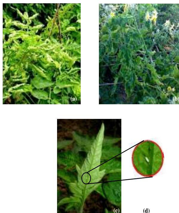
Figure 1. Tomato Leaf Curl Virus (ToLCV) infected leaf samples of tomato collected from Comilla and Jamalpur. Symptoms at different stages of tomato plant & Whitefly association a) Leaf curl symptom appeared in young stage, b) Symptoms during flowering and fruiting stage, c) Leaf curl symptom with whitefly and d) Magnified view of Whitefly.