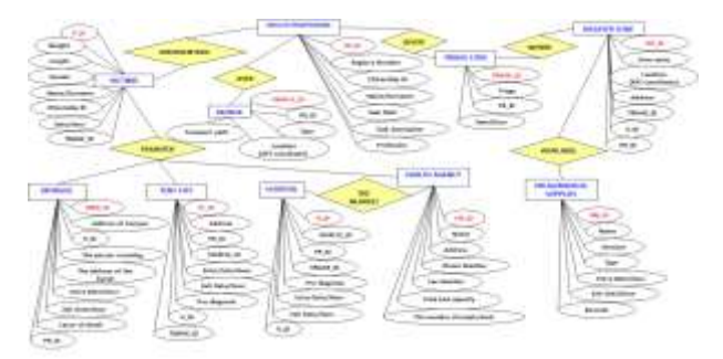
Figure 2. MMDIS entity-relationship diagram

Tables related with the data that will be stored in the database are designed as shown in Figure 2. With established relationships between entities, it's guarantied that data is stored more structured and more efficient.