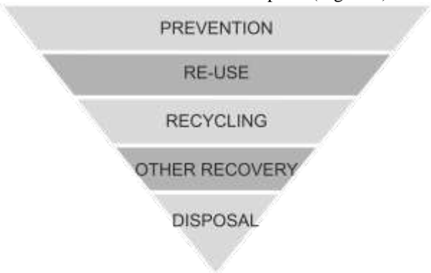
Figure 1 Addresses of the European Directive on Waste, 2008.

The European Union is committed to raise awareness among the member states to adopt tools and initiatives to implement a proper policy for the management of such waste. Prevention, preparation for reuse (introduced by Directive 2008/98 / EC), material recycling and recovery (eg energy) were identified as the most preferred options. The use of landfills is the last and least desirable option (Figure 1).