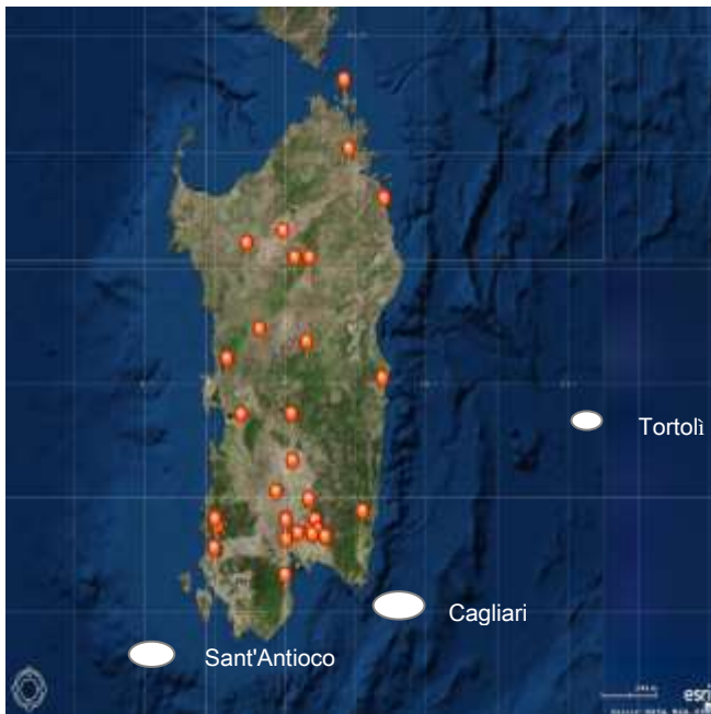
Figure 3 Localization of main processing facilities for recycled aggregates in Sardinia.

Not being able to realistically promote the use of CDW at a regional scale, as a result of the distances that exist between production centers (Figure 3) and the destinations (over 30 km, distance limit for aggregates established by regional regulations: VAS PRAE SARDINIA, 2014), it follows that the only way to limit the exploitation of mineral raw materials for aggregates should pass through an urban design that encourages compact over dispersed configurations (e.g. Sant'Antioco municipality). In addition, the processing facilities for recycled aggregates, although close to the places of destination, do not always provide sufficient material flows. This is the case of Tortolì and Cagliari.