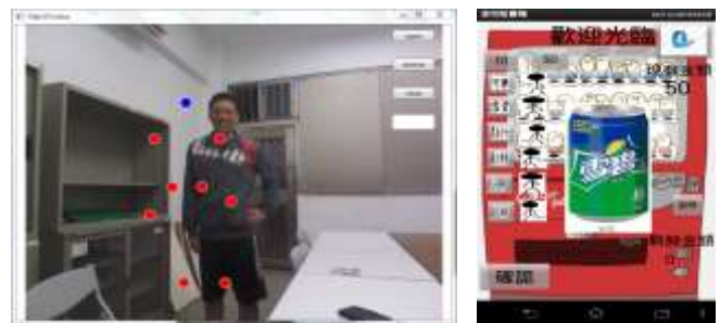
Figure 6. The gesture command "Putting the left hand on the left waist" made by an action player for purchasing the soft drink on the APP of vending machines of the smart device.