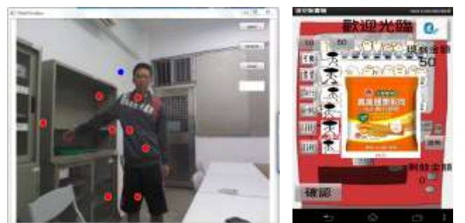
Figure 7. The gesture command "Waving the right hand" made by an action player for purchasing the cookies on the APP of vending machines of the smart device.