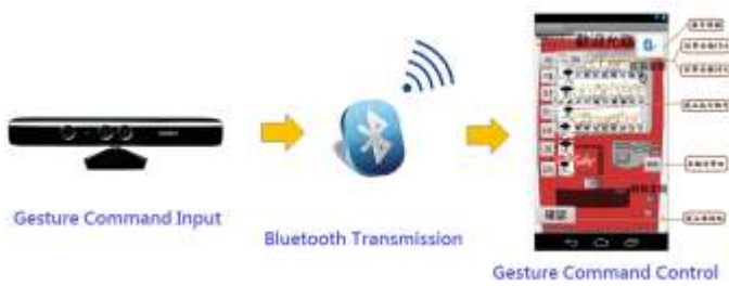
Figure 4. Kinect-captured gesture command made by the user for controlling the android application of vending machines through the Bluetooth wireless transmission.