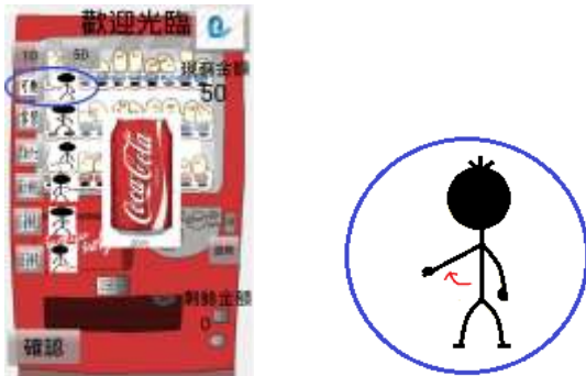
Figure 5. The android application of vending machine simulations where each vending item is indicated by a specific gesture action.

simulate the corresponding vending machine control operation through the Bluetooth wireless network. An interpretation work to translate the received symbol into the practical vending machine operation will also be done on the APP of the smart phone device.