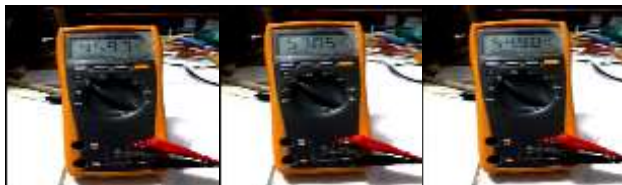
Figure 2.1.1 Result 1 Figure 2.1.2 Result 2 Figure 2.1.3 Result 3