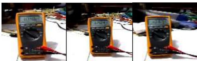
Figure 2.3.1. Result 1 Figure 2.3.2 Result 2 Figure 2.3.3 Result 3