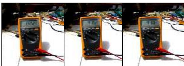
Figure 2.2.1 Result 1 Figure 2.2.2 Result 2 Figure 2.2.3 Result 3