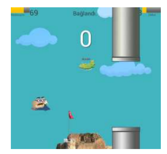
Figure 3. The maps are shown on screen in case of meditation

• Meditation represents the player's mental calmness and it is obtained by the measurement of alpha waves. When the player's meditation gets over 80 levels, maps that give extra 1 point to the player are displayed on the screen as in Figure 3. When meditation level drops below 80, new maps are out on the screen.