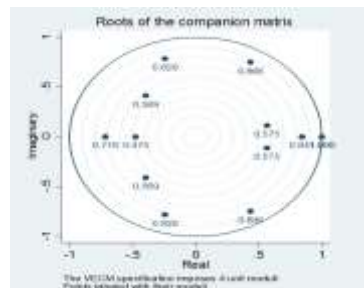
Fig. 2. VAR roots of characteristic polynomial. Note: blue dots indicated characteristic root

Table 5 shows the results of analysis short-run causal effect. We observed some unidirectional Granger causalities; (1) running from energy consumption to FDI, (2) running from economic growth to energy consumption. In long-run causality, we find that in the short-run FDI and CO_2 emission are bidirectional Granger causality. Apart from these, our findings reveal that in the short-run GDP and FDI do not Granger cause each other(i.e. neutral causality).