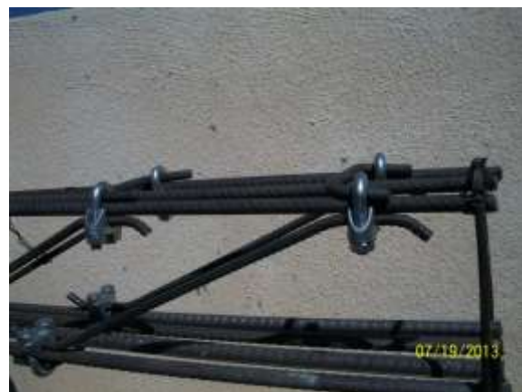
Fig. 2: Typical U-Link swimmer bars