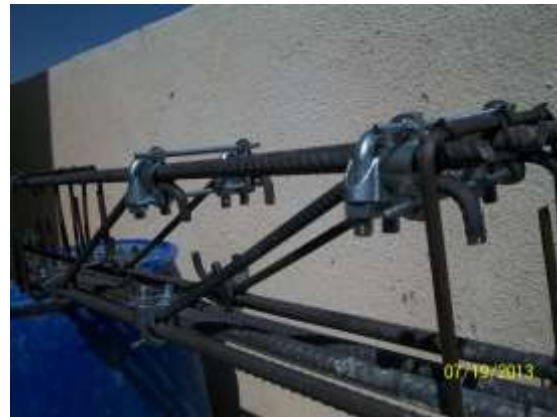
Fig. 1: Typical bolted swimmer bars