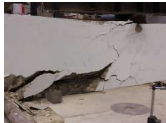
Fig. 5: Beam SSB at failure stage.

Figure 6 shows the maximum applied load the beam carried just before failure. All of the tested beams in this study failed by shear. The beam of welded swimmer bars exhibit similar strength as the other beams reinforced with