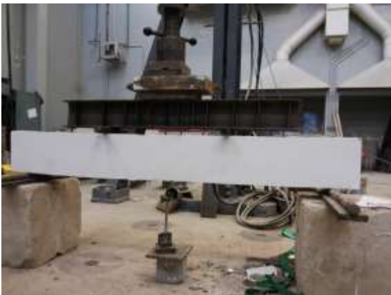
Fig. 4: Experimental set up and crack monitoring

A loading jack was placed at the mid-span position above the beam. The load was applied by jacking the beam against the rig base member at a constant rate until the ultimate load capacity of the beam was reached. A reasonable time interval was allowed in between each 20.0 kN load increments for measuring deflections, marking cracks, measuring the shear reinforcement strain and recording the ultimate load. Each beam took about two hours to complete the test. The cracks were monitored at each load increment. Figure 4 shows the experimental set up.