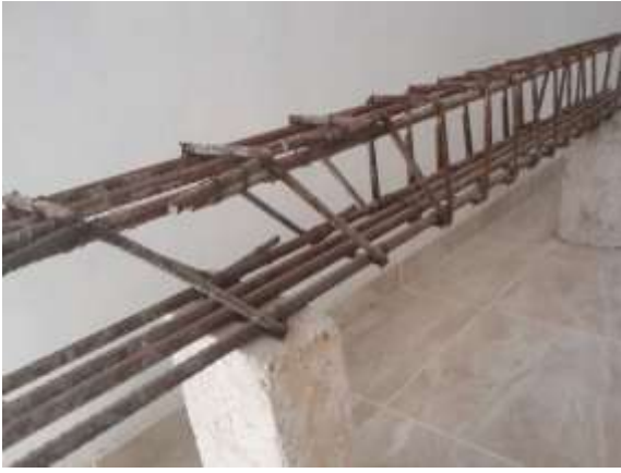
Fig. 3: Typical steel cage reinforcement of the beam reinforced with spliced swimmer bars.