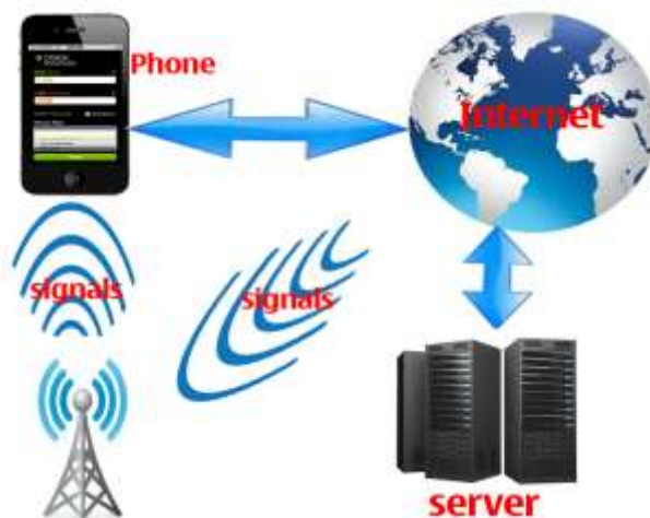
Figure 2 Technological design of m-learning

The recommended m-learning implementation is based on a smart / cellular phone, learning management system, communication technologies and the Internet as depicted in fig 2.