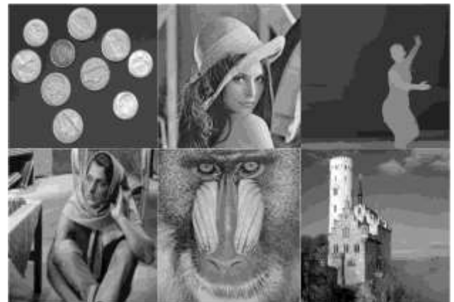
Figure 3. Test images.

We apply our best tree on the following 6 test images, i.e. Coins, Lena, Ballet, Barbara, Baboon, and Lichtenstein.