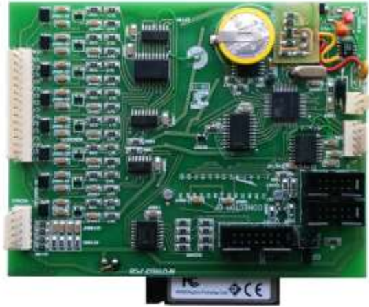
Fig. 1. Photo of the hardware prototype.

where l is the loop length (that it is assumed to be the same for both loops).