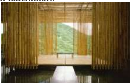
Figure 1 Internal bamboo walls

this point a controlled jet of concrete has been executed to make everything compact. In practice, the bamboo cane has been used as lost formwork. The structural properties of the bamboo get increased during this process, solving the fragility caused by its inherent flexibility without minimally changing the aesthetic characteristics.