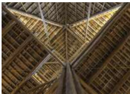
Figure 2 Picture of the bamboo roof

These houses have been built by combining artificial and natural materials. They are born from the collaboration between TYIN, non-profit humanitarian organization that operates in the field of architecture, and local workers, in a mutual exchange of knowledge. The structure in wood and steel, prefabricated and assembled in site, allows to lift off the ground the huts, preventing deterioration due to moisture. It rests on the concrete cast in four old tires reused. The bamboo taken from local reserves close to the site and braided according to local tradition was used as a coating. The roof of shaped tinplate has a geometry similar to the wings of a butterfly, which facilitates natural ventilation and collects rainwater to be stored for long periods of drought.