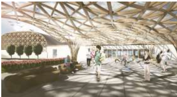
Figura 4: Bamboo external gridshell

This study analyzes the different applications of bamboo as building material within the project of a civic centre, where it shapes a big gridshell held up by tree-like pillars, realized with twenty centimetres diameter bamboo reeds. The resistance of this material, mixed with its huge highness, allowed to cover the whole free-space atrium of the civic centre with the bamboo gridshell. It covers 1500 square meters and two different levels, achieved by ramps. It is made by laminated bamboo strips, bound together by metal rivets.