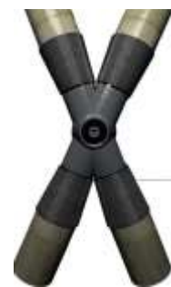
Figure 3 The node between Bamboo culms

Bamboo poles are connected together with high tech metal "X" joints to create the exoskeleton of the home. Round platforms act as floors, which are accessed by a circular staircase that wraps around a central supporting element. Wooden slats and glass panels bend up the exterior in a double helix to light the rooms and encourage ventilation. Finally the whole structure is wrapped in canvas to seal the inside off.