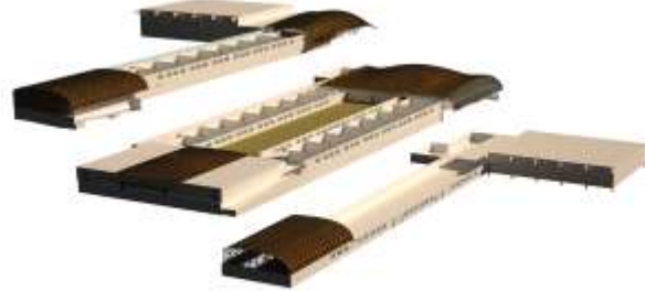
Figure 5: Plan of the civic centre, showing the roof made of bamboo

pillars, while the gyms and the auditorium are designed only with laminated elements.