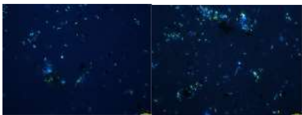
Figure 2. Biofilm of the biofilters captured with a fluorescent microscope (Ex: 340/380 nm; Em. > 425 nm, dichromatic mirror 565 nm, Leica DM6000B): biofilter 1 (left, 0.1 ml) and biofilter 2 (right, 0, 1 ml).

So, low efficiency of the biofilters may be linked to the high residual concentrations of ozone before biofilters (average concentration of 0.31 mg/l) and low water temperature ( 3.5^\circ\text{C} ), which was identified during this study.