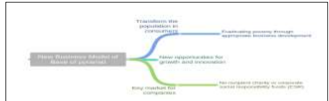
Figure 4. BoP Business model. (Adapted BORADKAR, P; KULKARNI, U; 2010.)

Second Boradkar, Kulkarni, (2010) the new business model predicated on three assumptions: the population of BoP that currently represents a latent market can be transformed into consumers, thus eradicating poverty through an appropriate business development. It presents, therefore, new opportunities for growth and innovation, making it a key market for companies, rather than a single recipient of charity or funds of corporate social responsibility (CSR) and show on the figure 4.