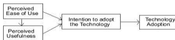
Figure 1. A Representation of Elements in the TAM