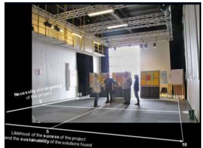
Figure 2: Example of a micro-constellation work in a small group of representatives of the relevant environment

Figure 2 offers a certain insight into how things happen within such micro-constellation settings.