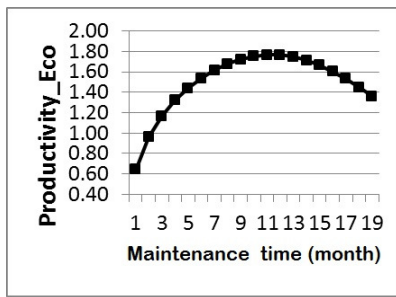
Figure 1. Productivity changes with time T_{MT} in basic adaptive/perfective maintenance without influences of factors

To understand different influences to the economic productivity in adaptive/perfective maintenance activities, firstly we analyse the basic economic productivity without influence of factors. We set up a simulation using the economic productivity model and set values as follows: S_{Dev}=10000 , S_{Add\_Val}=2000 , \alpha_{No\_MT}=0.8 , \alpha_{AdaPec\_MT}=0.85 , K_{MT}=1000 , T_{bef}=6 , r=0.03 , \sigma=0.25 . T_{MT} changes from 1 to 19 with the interval of 1. Fig. 1 shows how Productivity\_Eco changes with T_{MT} . The simulation results indicate that for adaptive/perfective maintenance without influence of factors, the economic productivity at first inclines then declines with time.