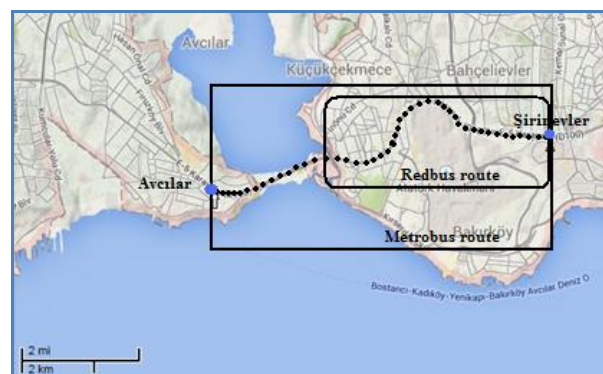
Figure 1. The study domain along the D-100 highway (*between the arrows)

Home to 16 million, Istanbul is Turkey's most populous city. Its' traffic is very congested, with registered vehicles numbering around 3.5 million [7]. The study area is located in Istanbul's European side between the districts of Avcılar and Bakırköy, which include dense commercial and residential areas. The D-100 highway passes through these areas. Figure 1 shows the traffic routes along the D-100 highway between Avcılar and Bakırköy. In this area, there is massive human density during commute times every day, with daily traffic averaging approximately 100,000 vehicles. The most preferred means of public transportation in this area are metrobuses and buses, therefore the sampling study was carried out for both modes of transport.