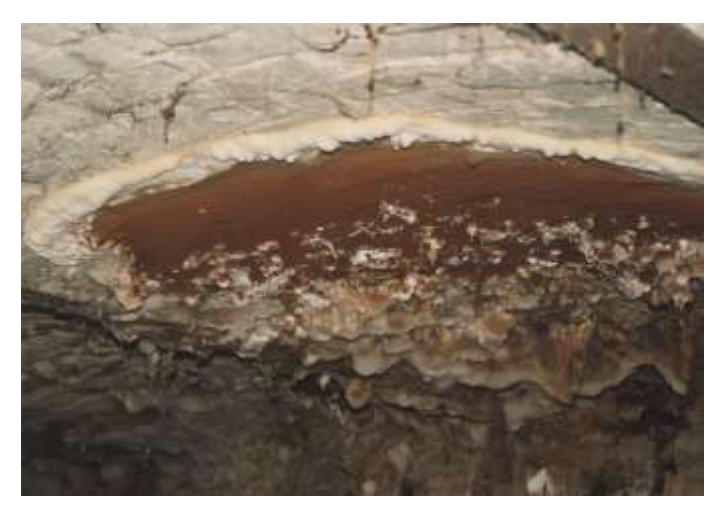
Fig. 5. The fruiting body of the house fungus proper (Serpulla lacrymans), grown into a vaulted ceiling of a basement room

repairs involving the replacement of electrical installation. Grooves carved in renovating plasters were filled with gypsum mortar. After re-painting the walls, the whole installation layout was visible. A common mistake of the owners was also poor care for sufficient ventilation of rooms. In many cases, the air grates were veiled or blocked with furniture. Consequently, this has led to the emergence of the house or moldy fungus [12].