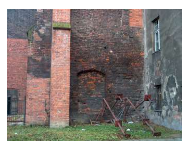
Fig. 3. Moisture level of the northern wall reaches approx. 5 m high above ground level - Museum in Raciborz.

and built completely independent from each other, leading to the formation of clusters and strings of underground compartments which, in an uncontrolled manner, interfere with the natural hydrographic conditions. The current investment activity in urban centers is conducted in a manner which ignores important geotechnical and hydrogeological conditions. Deep underground floors pose a threat of ground water accumulation or change in the direction of their runoff. Designers of newly erected buildings do not take into account potential impacts on the hydrogeological conditions sometimes in a considerable area around the erected building.