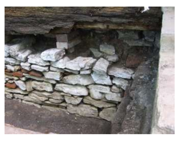
Figure 2. Appearance of the exposed foundation walls of different construction. \,

determination of the wall structure - an element necessary to examine the structure of the walls is performing drillings at different heights. In the past, brick was a relatively expensive material, far more expensive than it is now. The consequence was building 'beggar' walls in which the stem was made of less expensive materials. Bricks were only used for the facing wall layer. In the walls of historic buildings the very method of their construction, the type of material, and many centuries of effort caused the development of a variety of irregular voids, caverns and stretch marks. Test drillings may confirm the necessity of initial injections e.g. of low-shrinkage trass mortars in the divisions. This is the basic condition (both for pressure and non-pressure injection) for properly restoring the horizontal diaphragms. Low-pressure injections within the walls with voids result in a given standardized amount of injected product not filling properly the injection holes.