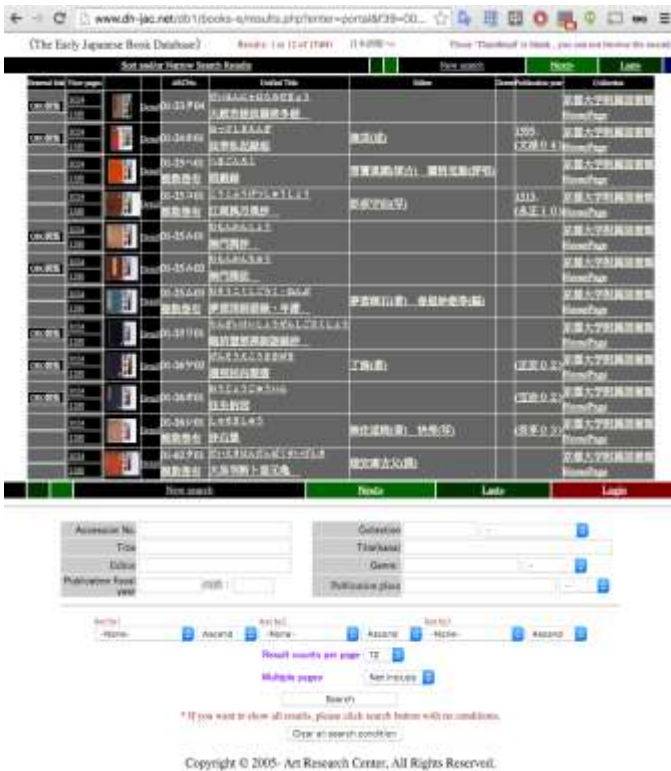
Figure 2. Search results of ARC Early Japanese Book Database.

bilingual data; and 2) normalizing data, merging and displaying results in a user-friendly way.