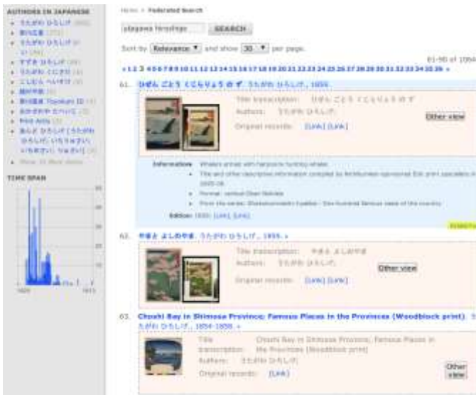
Figure 6. Search results with Japanese data.

Furthermore, faceted interfaces offer a new way of finding and browsing databases as an addition to the typical keyword searching and browsing. In the proposed system, a facet generation task has been implemented and applied to authors, genre and subject fields.