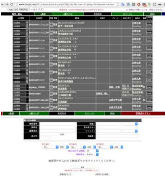
Figure 3. Search results of ARC Japanese modern book database.