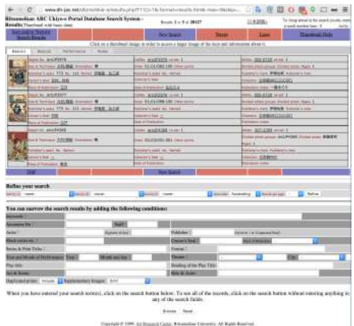
Figure 4. Search results of ARC Ukiyo-e Portal Database.