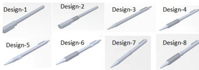
Figure 3. Pen Design Development

The collecting of Kansei Words based on survey in Phase-1 (Comfortable, Slippery, Convenience, Attractive, Stylish, and Beautiful) and Phase-2 (Miserable, Slippery, Irritating, Boring, Simple and Ugly) are pairing towards the SD scale in weighted of seven. While the preference of design is constructed into the Likert type with seven scales as shown in Figure 4.