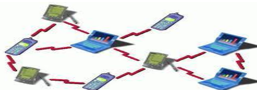
Figure 1 MANET Overview

One of the core security issues is trust management. Trust is generally established and managed in wired and other wireless