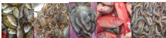
Fig. 2. Some of the bounty catches in the coastal waters of Catarman, Northern Samar.

Based on the data gathered, the Ichthyofaunal biomass around Puputihon patch reef and UEP -Cawayan fringing reef at 1-4 meters depth range is estimated to be at 9.87 kg per ha. The data range comprises fish species that were observed within 1- 4 meters depth only due to the limited water visibility during the time of sampling. Though the data gathered might not depict the true picture of the fish stock in the area due to the lacking data set for the fish species occurring at greater depths, the fish species observed could be considered as major contributors to the total fish stock in the area and plays a significant role in the trophodynamics processes and fish production as suggested by its dominant share in the fish catch of the resource users from the nearby fishing communities of So. Cataogan, and Parola of Brgy. Cawayan, Catarman, Northern Samar.