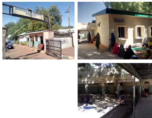
Figure 2 Entrance and the labour wards at the Specialist Hospital, Sokoto

Tertiary-level services are highly specialised and focus mainly on curative care, teaching and research [8]. In Nigeria, the federal ministry of health- FMOH is responsible for policy formulation, technical assistance and service provision through tertiary teaching hospitals and federal medical centres. The tertiary health institution mostly includes specialist/teaching hospitals that handles complex health problems/cases either as referrals from general hospitals or on direct admission to its own [1].