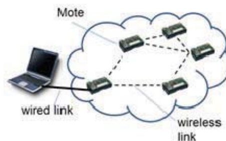
Figure 1: Architecture of a sensor network

The software infrastructure for motes provided by Crossbow allows a mote can be programmed by first connecting the mote directly to a base station (computer) via a serial or a USB port. The complied program image can be downloaded from the computer on the mote. For example, to deploy an application on the sensor network in Figure 1, each mote must be directly first connected to the PC and programmed. However, sensors systems that have already been deployed pose a new challenge. As these systems may have to remain deployed for a period of time, there are situations where the network nodes may have to be re-programmed after deployment. Reprogramming may be needed for several reasons such as software updates or deployment of new algorithms. For such already deployed networks, the reprogramming of nodes may have to be accomplished remotely over the air, and in some cases, this might be the only alternative. For example, for a sensor network deployed in a forest, directly connecting each mote to the base station may not be an option [3, 5]. Deluge is a protocol that has been developed for such remote re-programming of nodes [7, 9]. This protocol, for instance, allows the computer in Figure 1 to