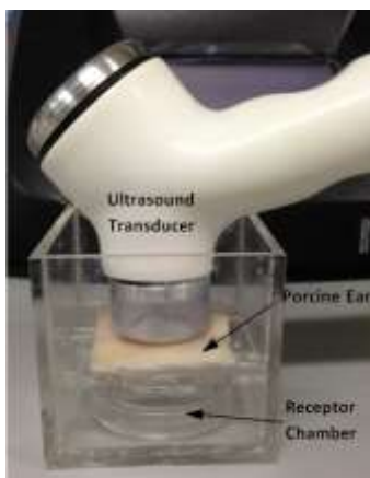
Figure 1. Representative photo of the experimental setup for using ultrasound in the transdermal drug delivery.

Porcine ear skin was used here because of its similar dermatopharmacokinetic characteristics (i.e., diffusion and partition of the drug in the SC) as human skin and prepared using the previously described protocols (Sekkat et al. 2002, Herkenne et al. 2006). Fresh porcine ears were purchased from a local slaughterhouse (Primary Industrial Pte Ltd, Singapore) after the approval from Agri-Food Veterinary Authority (AVA) of Singapore, cleaned under cold running water, and immersed in the phosphate buffered saline (PBS) solution to remove remaining lipids. Any visible hairs were carefully plucked out. Skin membranes were removed from the underlying cartilage, cut into the size of 2.3×2.3 cm, wrapped in aluminium foil, and then stored at -20°C for use within three months. Thickness of skin specimens were 1.5±0.4 mm measured by a digital caliper. On the day of the experiment, the tissue samples were soaked in PBS at room temperature (23 ± 1°C) for about 1 hour to thaw the specimen and to allow its initial barrier property to reach a steady state.