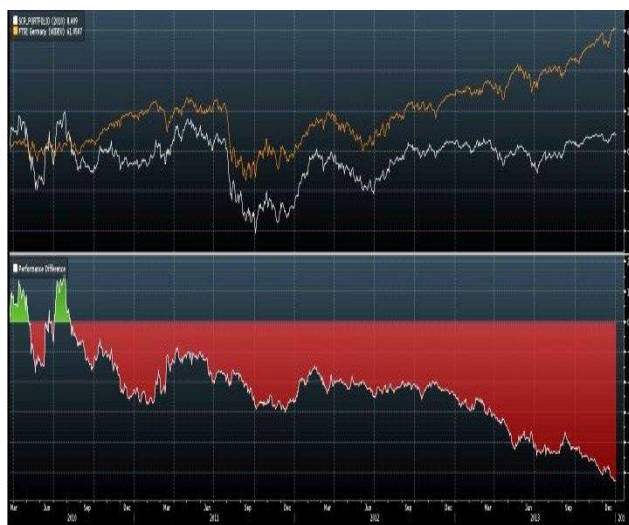
Figure 3. Portfolio Performance vs. Benchmark (March 2010 – December 2013). Data Source: Bloomberg. Own calculations.

Figure 3 presents test portfolio performance (white line) vs. benchmark (yellow line) in the upper graph and performance difference in the graph below.