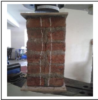
Fig 1 : Vertical Splitting Cracks