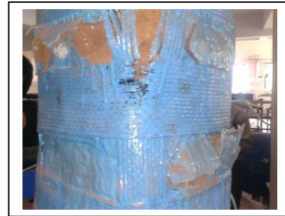
Fig 6 : Failure of CWOA Specimen

CFRP retrofitted specimen in both cases with anchor and without anchor failed by rupture of FRP. The vertical strips got fractured first and the brick masonry inside was crushed completely to powder form. The load was carried by the specimens till rupture of horizontal strip occurred. Figure 6 shows photograph in which rupture of horizontal strip can be seen. The specimen with anchor showed increased capacity as compared with specimens without anchors.