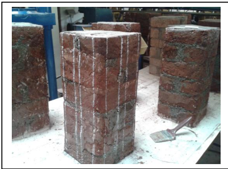
Fig 2 : Marking for FRP strips on Primer applied specimen