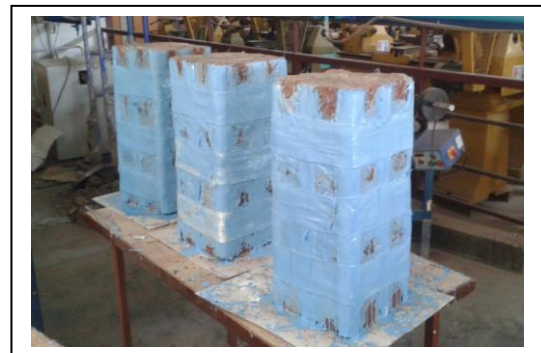
Fig 4 : GFRP without Anchors

Figure 4 shows photograph of GFRP wrapped specimens. All specimens were tested under Universal Testing Machine (UTM) of 100 tonnes capacity for uniaxial compression till failure.