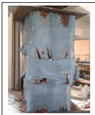
Fig 5 : Failure of GWOA Specimen

In case of GFRP retrofitted columns without anchors, failure occurred by delamination of GFRP horizontal strips from brick masonry surface. In some portion the part of GFRP strip got delaminated along with brick masonry material. Vertical GFRP strips showed fracture but horizontal strips predominantly failed due to delamination which can be seen in Figure 5. In case of specimens with GFRP anchors, more confinement was achieved as the anchors delayed the delamination of horizontal strips and specimen could carry some more load but ultimately failure occurred due to delamination.