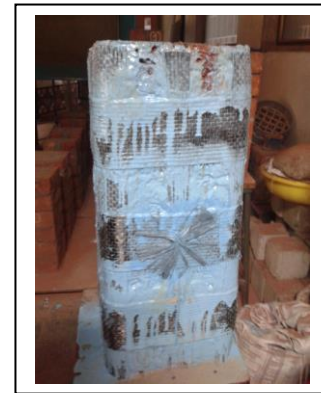
Fig 3 : CFRP with Anchors