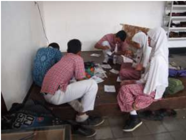
Figure 2. Some student visitors learned to wax pattern on cloth with canting ( Nglowong process)

Fig. 2 shows some students who visited the museum had a chance to learn how to do Nglowong on a small piece of cloth.