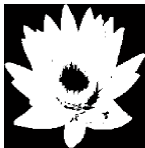
Figure 5. Morphological Filling

Finally, the segmentation result is corrected by mathematical morphology methods.