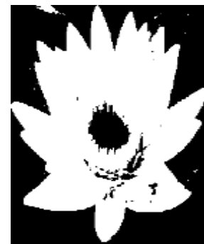
Figure 3. Two-dimensional OTSU segmentation result

So segmentation by two-dimension OTSU of automatic threshold in a-channel.