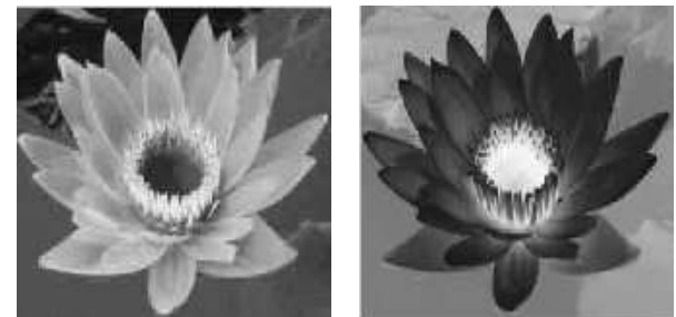
(c) Image of a-channel (d) Image of b-channel Figure 2. Results of channel separation

So segmentation by two-dimension OTSU of automatic threshold in a-channel.