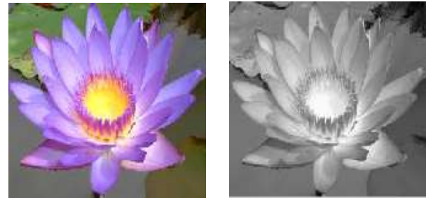
(a) Original image (b) Image of L-channel

First the color image of RGB space is changed into Lab space. Next, due to the negative end of a-channel reflects the color feature of image, the L, a, and b channels are split.