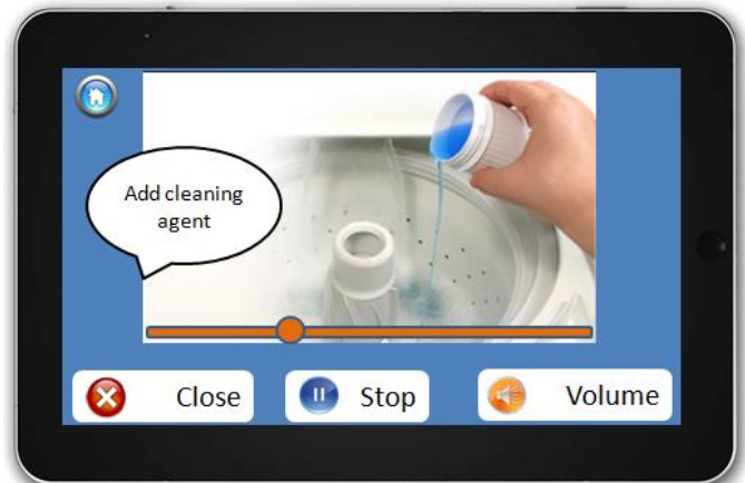
Picture 2 Mock-up of the PIA interface

information about potential users. Participants were 16 older people (eight female, eight male, 50+ years old) and 30 formal and informal carers (15 female, 15 male, between 30 and 70 years old). Participants were recruited within different organizations such as helpdesks for dementia and caring relatives. Questions were asked in an interactive group setting where attendees were free to interact and discuss with other participants. Furthermore short questionnaires were completed by all participants in order to gain some standardized information.