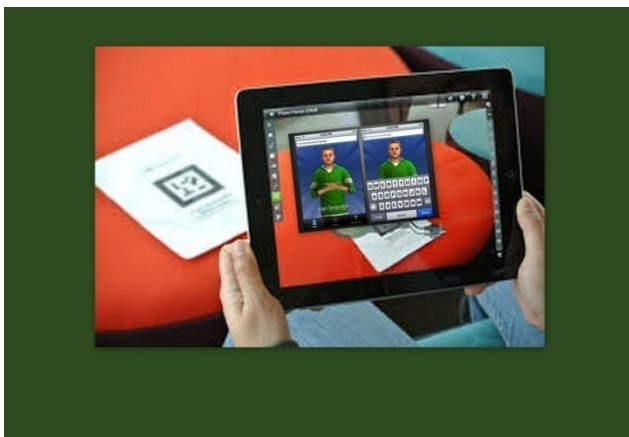
Fig.1. Using augmented reality, the signed video corresponding to the word in the dictionary is triggered on the mobile display screen[1]

Here we present a general description of the prototype of an augmented universal sign language dictionary. The main prerequisites for developing an augmented reality dictionary is: a) camera to capture the real world environment, b) display devices (head mounted displays or display screens), c) AR dictionary (with text/images). For an augmented dictionary, we require markerless image/text recognition. A mobile application has to be developed on any of the AR supporting platforms, which will recognize the text or images in the physical dictionary and this recognition will trigger a video of the sign in the International Sign Language with options to display the same sign in any other sign language as well. The application will use mobile's GPS and image recognition technology to look up the data (videos) from an online database. A database of video dictionaries of various sign languages such as "Signing Savvy" is required. Along with that, high speed internet connectivity such as a 3G or wi-fi is also required.