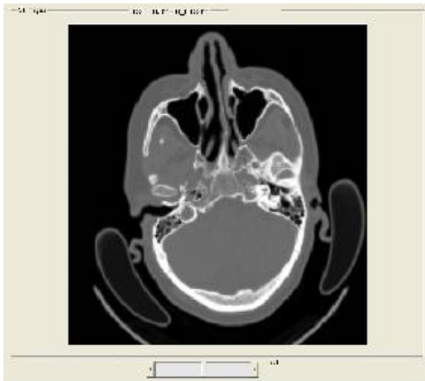
Figure 1: Image viewer created to view the dataset

The visualization of such data may be done in two-dimensional manner, where each slide can be viewed separately on the screen. Often this will require a bit of processing, because computers typically use 8 bits per color channel to represent an image - 8 bits for red, 8 bits for green and 8 bits for blue color. If CT slice is more than 8 bits resolution, the programmer needs to scale down CT's values to make them fit into 8 bits resolution range. The Digital Imaging and Communications in Medicine (DICOM) will contain all the details of the patient taken during the CT scan. This information might be sensitive if exposed to public for medical and non medical applications. DICOM is a binary protocol and data format. DICOM has many versions of the standard, with support for 8 and 16 bit images.