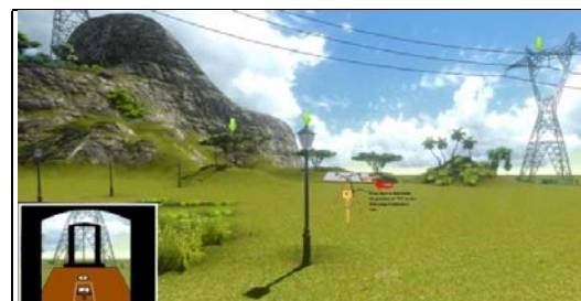
Fig. 4 shows 2D representation in Flash

Necessary help and steps at any stage in experiment are clearly displayed on the screen every time.