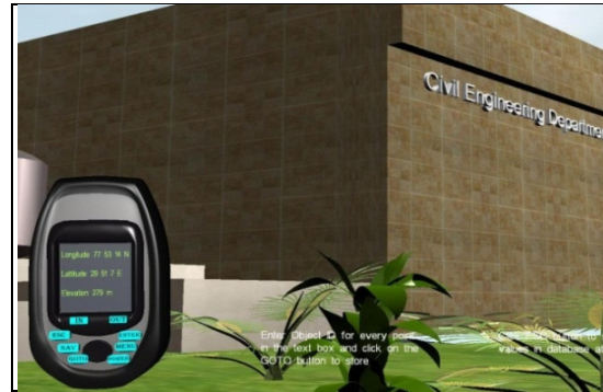
Fig 3 shows 3D GPS in 3D environment