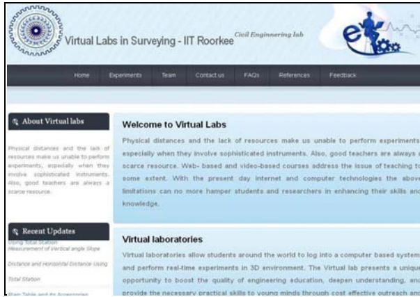
Fig. 1 Homepage of website