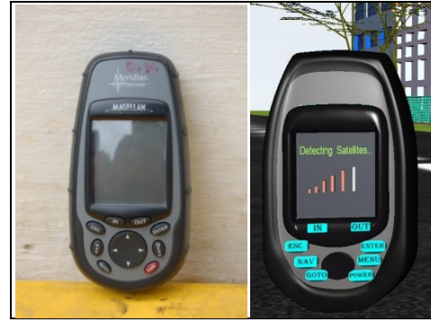
Fig. 5 Comparison between real GPS and 3D model of GPS